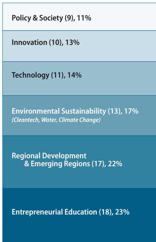
Figure 1. Publications by Topic (78 Total)